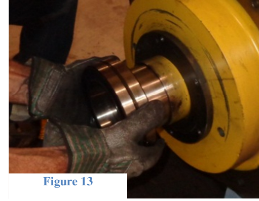
Bulletin 1165 Page 6 of 8 REV. A - 11/11/2014